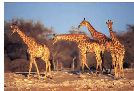
Wildlife - Pilanesberg National Park

An interesting social programme will be presented during the conference.