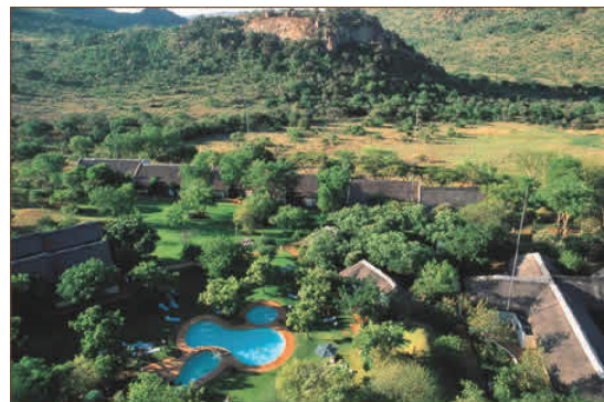
Conference Venue (Kwa Maritane Bush Lodge)

Under the general theme Tracking down the "Big Five" mineral deposits of southern Africa (Diamonds, Ferrous metals, Fossil fuels, Gold and Platinum), the conference is aimed at bringing together academics and professionals interested in a broad range of state-of-the-art geophysical approaches to mineral and energy resource exploration and development.