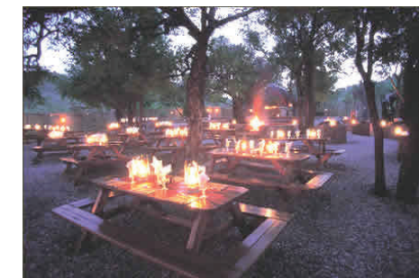
Kwa Maritane Bush Lodge

Southern Africa is also an exciting tourist destination. Facilities exist for delegates and accompanying persons to go on private sightseeing excursions and visits to appreciate the tranquility and magic of the Pilanesberg National Park (malaria free) ( http://www.places.co.za/html/pilanesberg.html ) or the adrenalin rush of Sun City ( http://www.suninternational.com ).