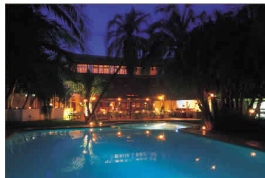
Kwa Maritane Bush Lodge