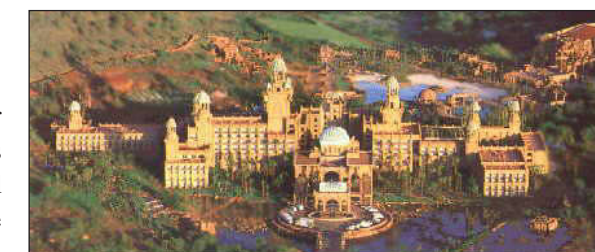
The Lost City

Southern Africa is also an exciting tourist destination. Facilities exist for delegates and accompanying persons to go on private sightseeing excursions and visits to appreciate the tranquility and magic of the Pilanesberg National Park (malaria free) ( http://www.places.co.za/html/pilanesberg.html ) or the adrenalin rush of Sun City ( http://www.suninternational.com ).